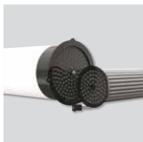
Tubular heat exchanger 100 or 150 mm.